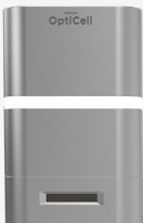
vetscan ® OptiCell™