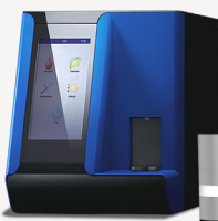
vetscan ® HM5

Elevate sick patient care with our cutting-edge diagnostic portfolio