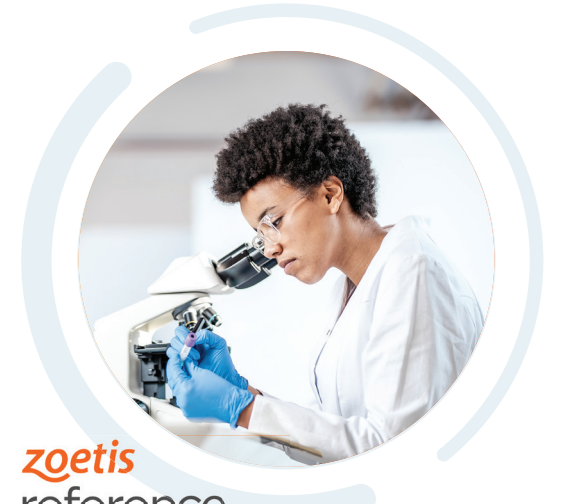
zoetis reference laboratories